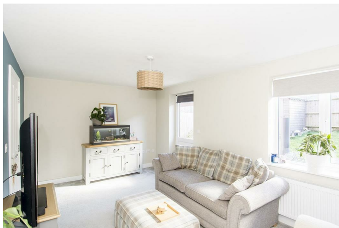
(Lounge Photo Two)

UPVC double-glazed window and rear entrance door to the rear garden. Storage cupboard. Radiator.