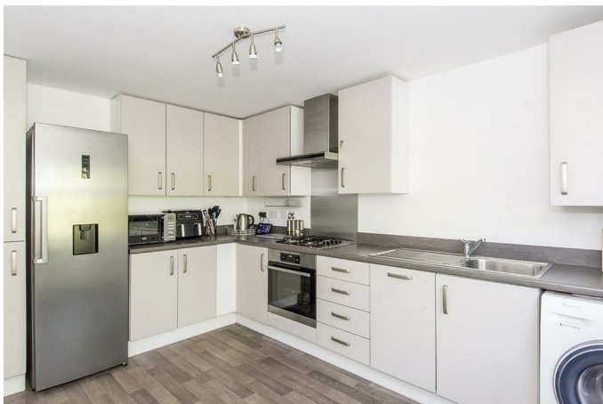
Kitchen/Diner 12'5" x 9'6" (3.78m x 2.90m)

UPVC double-glazed window to front. Fitted range of wall and floor mounted units. Gas hob. Electric oven. Stainless steel sink. Space and plumbing for washing machine. Space for fridge/freezer. Radiator.