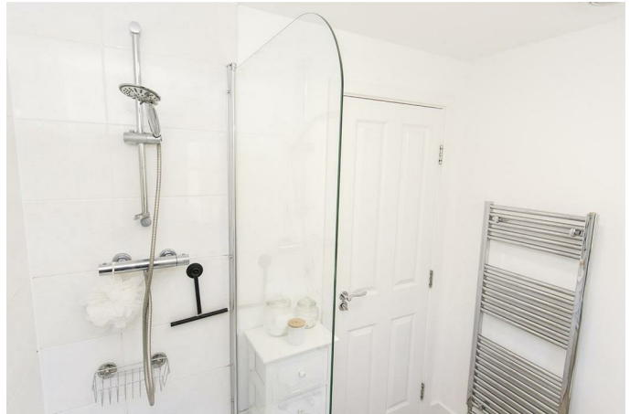
(Bathroom Photo Two)