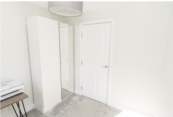
(Bedroom Three Photo Two)

UPVC double-glazed window to rear. Radiator.