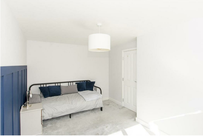
(Bedroom Two Photo Two)